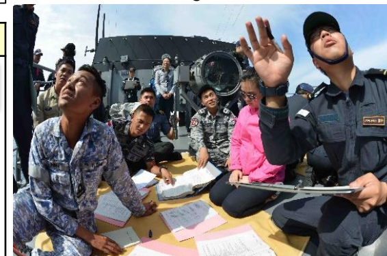
Navigation communication training using CUES