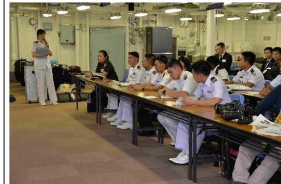
A briefing on board