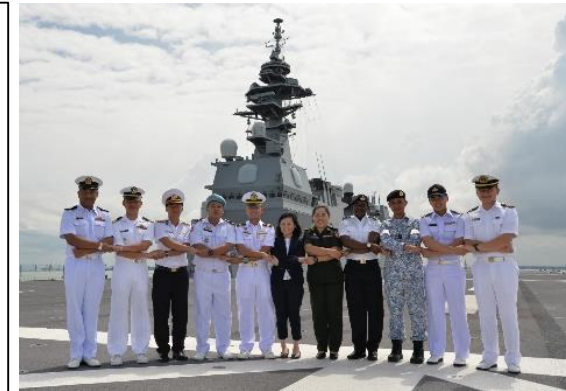
11 participants in the program on the deck of JS IZUMO