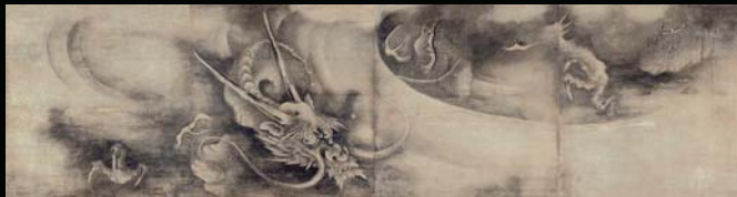
Dragon & Clouds

Artist : Kaibou Yuushou Date : 16th Century, Azuchi Momoyama Period Medium : Four Fusuma sliding door panels; ink on paper Original : Keninji Temple