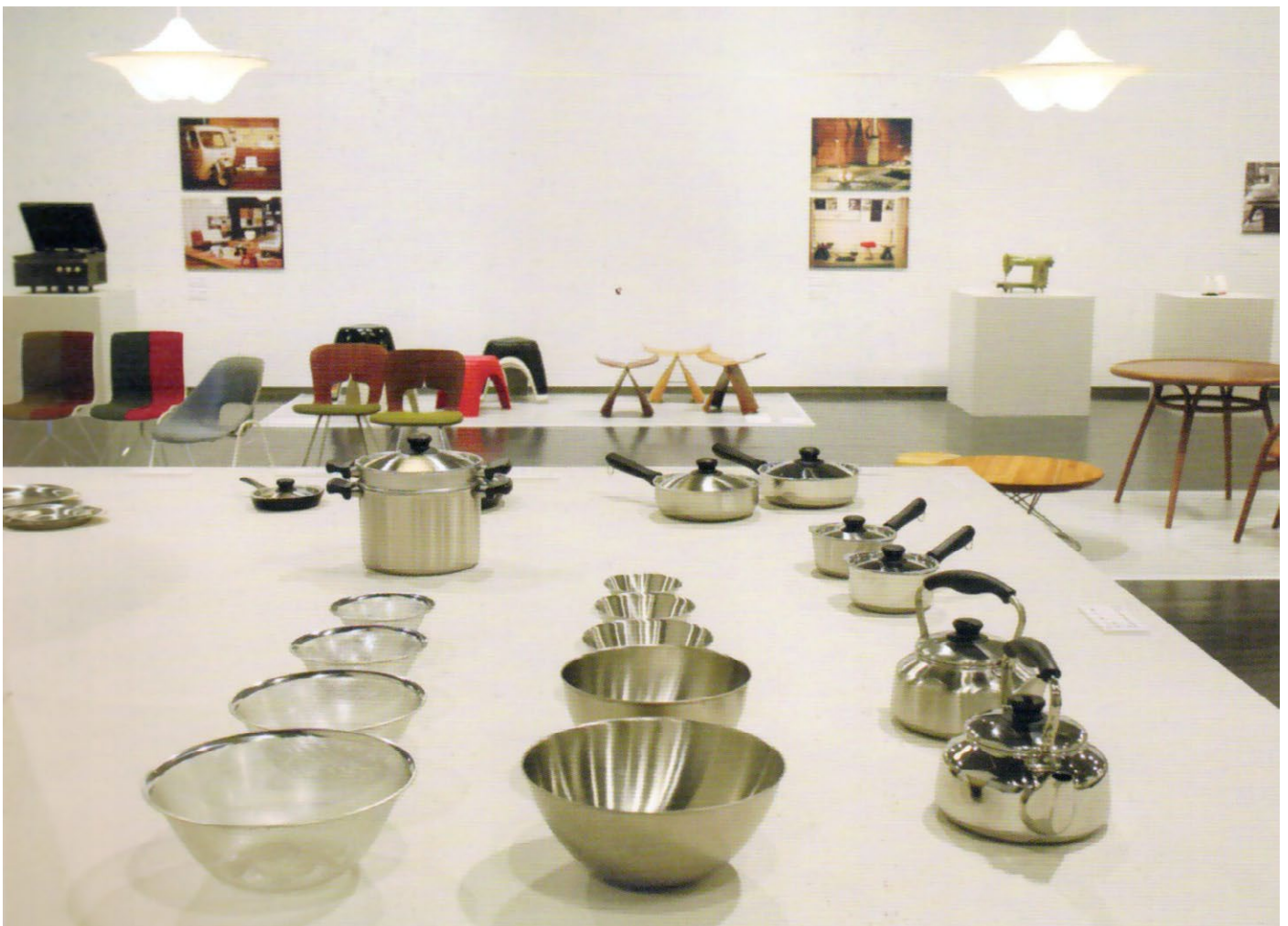
'Sori Yanagi: Design in Everyday Life', National Museum of Modern Art, Tokyo.