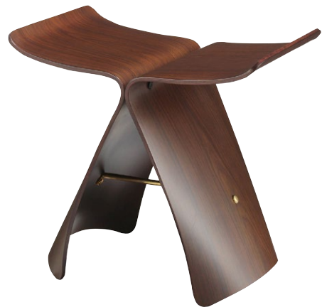
Sori Yanagi, 'Butterfly stool' 1954, bent plywood, brass, 41.5 x 47.5 x 34; seat height 35 cms