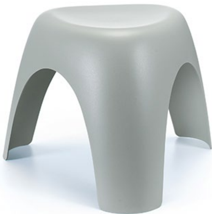
Sori Yanagi 'Elephant stool' 1954