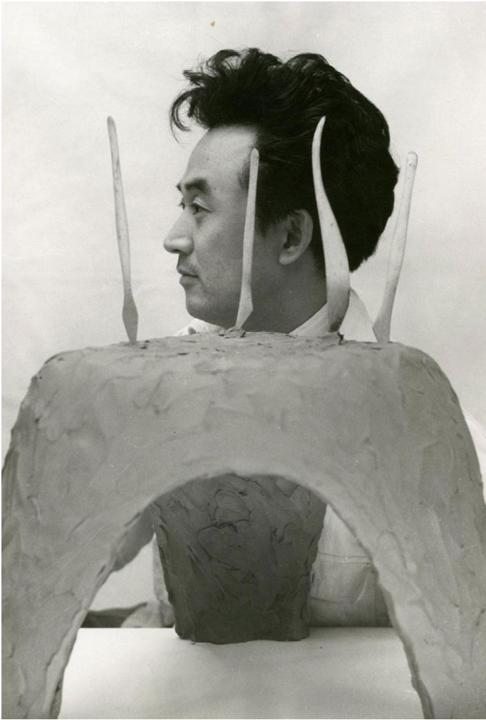
Sori Yanagi with elephant stool prototype 1950s, Japan.

Yanagi was known for approaching every idea by creating or sculpting it by hand, before committing to paper. Yanagi reshaped and revised his design considering usefulness, or balance of shape and weight. His 'think by hand' method has been passed down to designers over 5 decades.