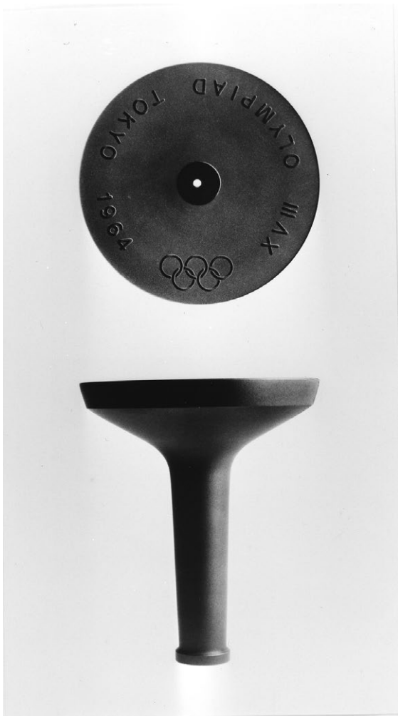
Tokyo Olympics: The Olympic torch holder, 1964

Sori Yanagi designed the Tokyo Olympic Torch holder in 1964 and Sapporo Winter Olympic Torch holder in 1972. Both of them were made of a light alloy, comprising mainly of aluminium.