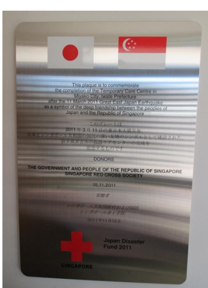
(Plaque at the entrance)