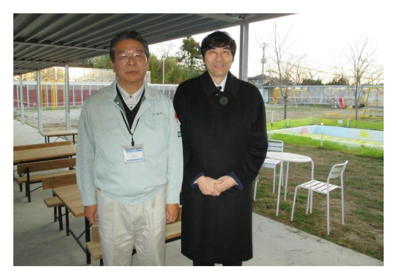
(With the Principal of Toyama Nursery School)