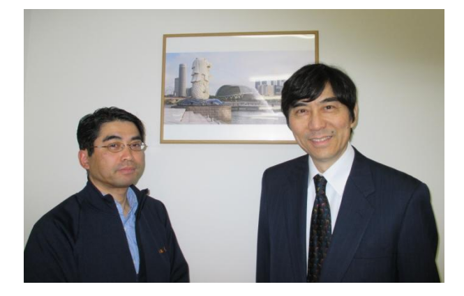
(With the Director of Taro Support Center)