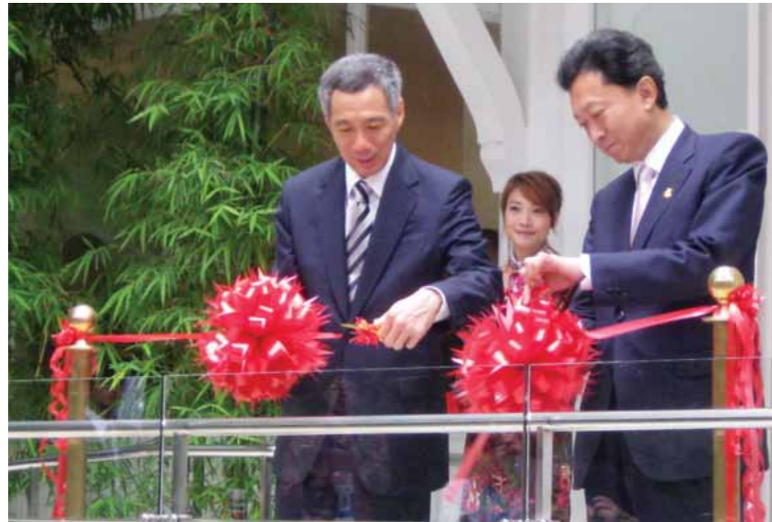
Opening ceremony of JCC

The Japan Creative Centre was officially opened by Prime Ministers of Japan and Singapore, with "Innovation & Tradition" as its main theme, the Centre introduces Japan's "soft power" and created a space where visitors can experience the charm of Japan. The centre aims to disseminate information about Japan to a broad area including Singapore and neighbouring Southeast Asian Countries.