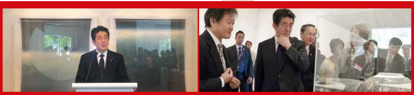
WA Project "KÖGEI: Art Crafts in Japan"