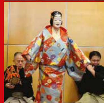
Noh Workshop at Library