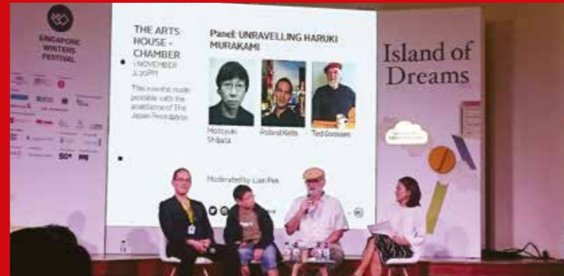
Singapore Writers Festival 2015