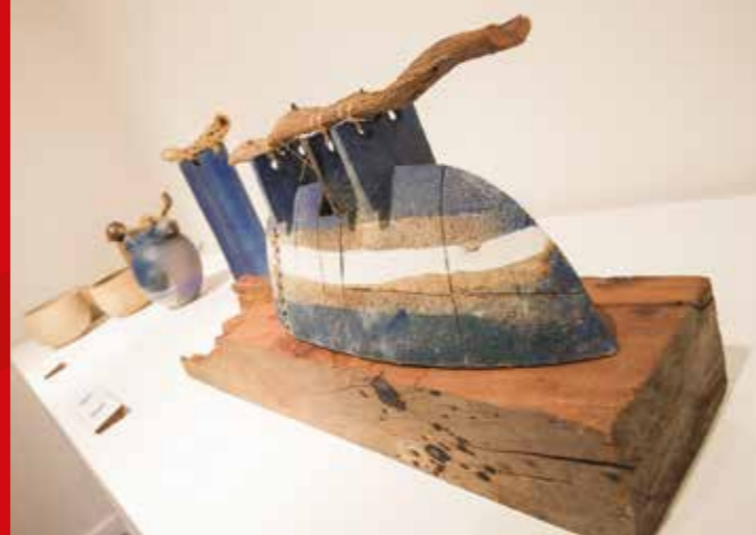
In Pursuit of the Ethical Pot by Iskandar Jalil