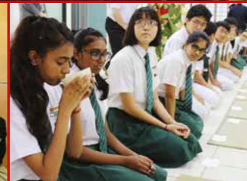
Enshu-ryu Tea Ceremony at Kranji Secondary School