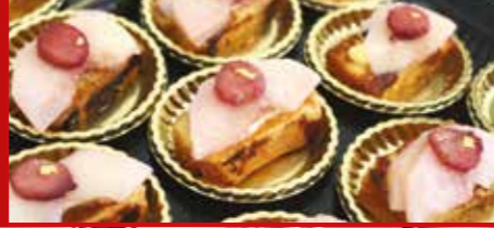
Savour the Finest Tastes of Yamanashi