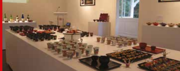
Traditional Crafts & Sake of Ishikawa