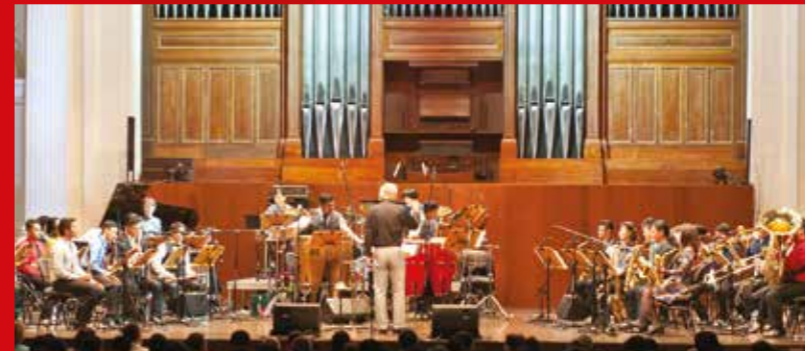
Asian Youth Jazz Orchestra