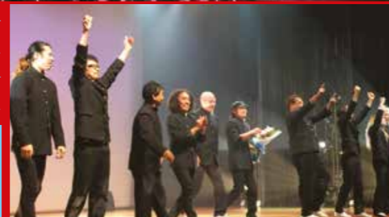
Condors Performance at Temasek Polytechnic