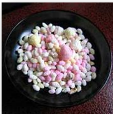
Hina-arare rice crackers

The top tier is reserved for the emperor and the empress. A miniature gilded folding screen is placed behind them, just like the real Imperial throne of the ancient court.