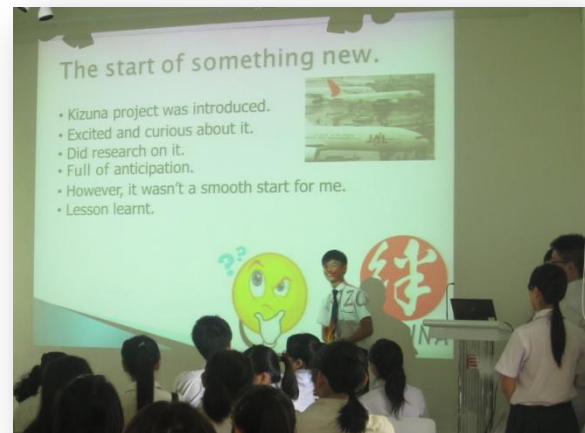
Group Presentation by participants from Woodgrove Secondary

Kizuna which means “Bonds” in English is a Youth-Exchange Project where youths from 41 countries are given the opportunity to travel and engage in various activities in Japan. Initiated in April 2012, Kizuna is a project put forth to promote international understanding of Japan’s recovery efforts from the devastating impacts of the Great East Japan Earthquake.