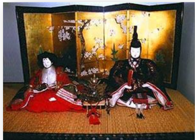
Dolls of the emperor, right, and empress sit on the top tier

The dolls wear costumes of the imperial court during the Heian period (794-1192) and are placed on a tiered platform covered with red felt. The size of the dolls and number of steps vary, but usually the displays are of five or seven layers; single-tiered decorations with one male and one female doll are also common.