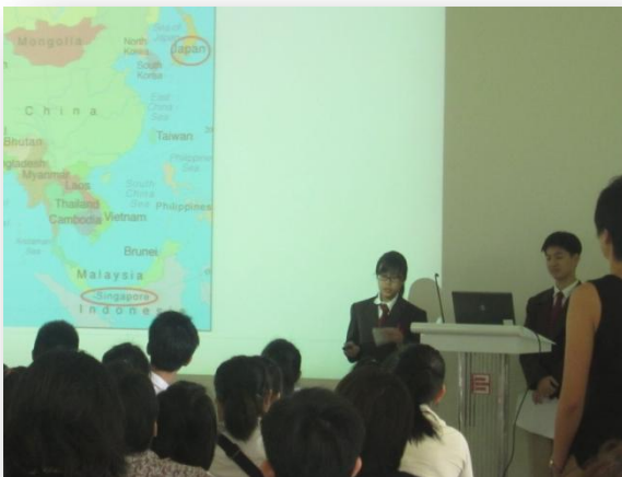
Group Presentation by participants from Hwa Chong Junior College

This year, the Embassy of Japan in Singapore provided this opportunity to various education institutions in Singapore where many interested students participated. To make known their