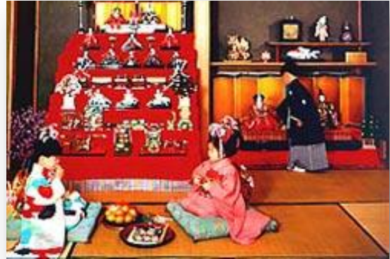
These children enjoy Hina Matsuri dressed up like dolls themselves.

Most families take their beautiful collection of dolls out of the closet around mid-February and put it away again as soon as Hina Matsuri is over. This is because of an old superstition that families that are slow in putting back the dolls have trouble marrying off their daughters.