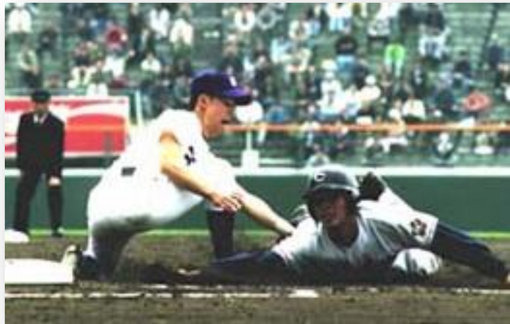
The end of winter means it's time for high school baseball action once again!

The invitational, held during spring break, began in 1924, nine years after the summer competition started in 1915.