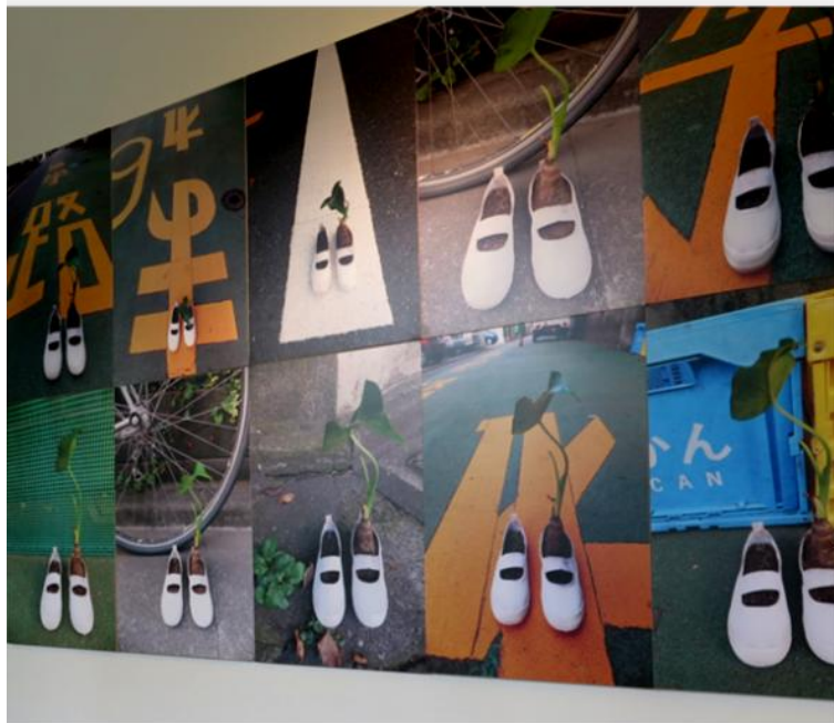
My Shoes 02, 2013