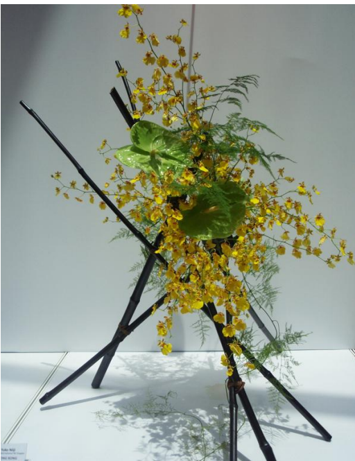
"In Blossoms" Flower Exhibition