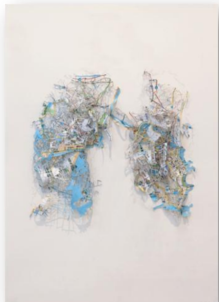
Lungs, Botanical Garden, 2013