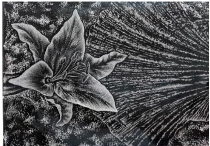
"10 Nights of Dream" Glass Art Exhibition

Further information and updates about JCC events can be found on the JCC Website and Facebook