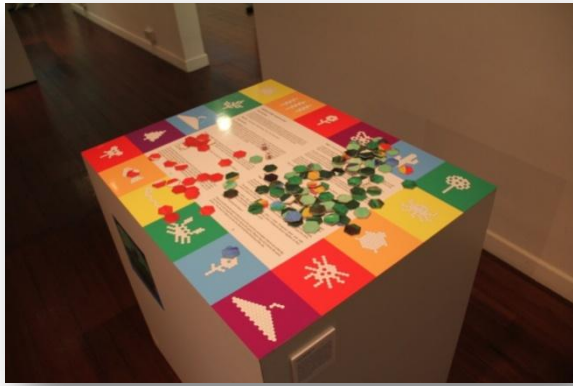
Interactive piece by Curious Minds