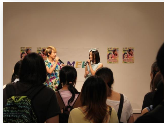
Fans gathered for J-MELO were thrilled