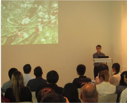
Presentation by a KIZUNA participant

Two events were held on the 18 th of May. One of which is a sharing session by 9 groups of students who have travelled to Japan as part of a Youth-Exchange Project, KIZUNA (also known as “bonds”).