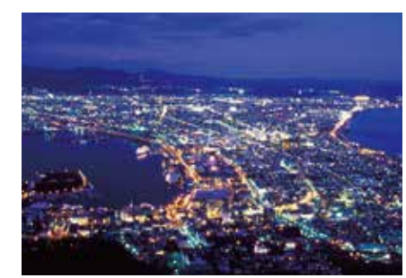
Night view in Hakodate City