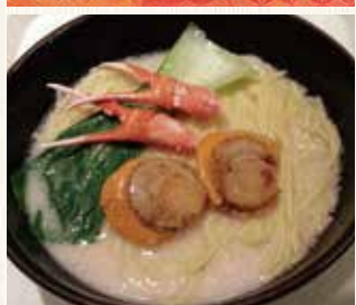
(Seafood tonkotsu ramen) We are particular about our ingredients from Tokachi, Hokkaido.