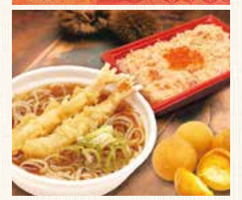
We have prepared delicious Hokkaido food for you. The rice is of course 100% from Hokkaido.