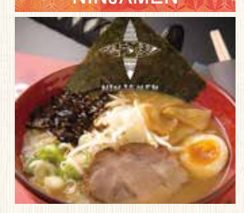
With a consistent flavour and quality, no matter where you find it in the world, Ninjamen is a new chain of ramen restaurants and we'll be ninja-ing to Singapore too!