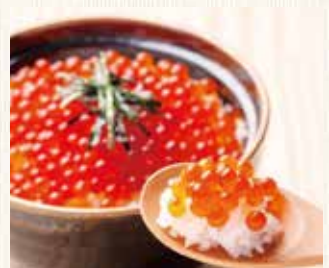
We came all the way from Hokkaido to bring you salmon roe. This is the real deal!