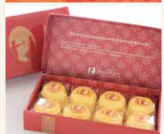
We bring to you a melt-in-your-mouth cheesecake, only made possible with ingredients from Hokkaido.