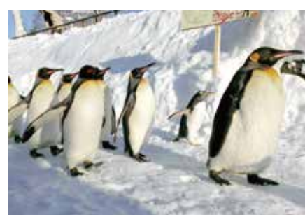
Asahikawa Zoo in Asahikawa City